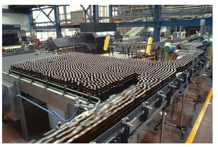
SWEPCO 115 Food Machinery Grease is a premium quality food grade grease rated for use wherever incidental contact with food can occur.

SWEPCO 115 was formulated specifically to exceed USDA/NSF H-1 and Canadian Food Inspection Agency "n" requirements for a grease capable of incidental contact in food and beverage processing industries. This high performance aluminum complex grease is ideal for use on high speed can seamers, juice extractors, filling equipment, labelers, packaging machinery, peelers, shaker screens, conveyors, valves, bread wrappers, meat cutting equipment and other food processing and packaging machinery. High and low temperature performance are superior to ordinary aluminum, clay or polyurea base food machinery greases. It also stays where you put it, providing long lasting service, extended greasing intervals and reduced grease consumption.